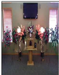
MUSGROVE FAMILY CENTER