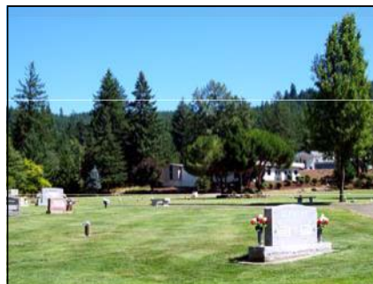
SPRINGFIELD MEMORIAL GARDENS