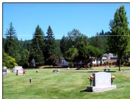
SPRINGFIELD MEMORIAL GARDENS